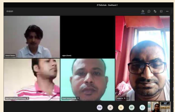
JOHNSON PEDDER PAATHSHALA- ODISHA