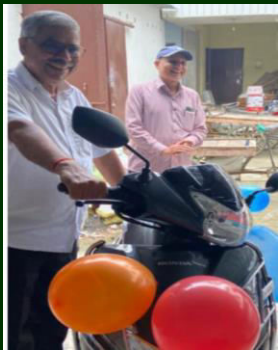
HONDA ACTIVA SCOOTY

Umang – an exclusive loyalty program for esteemed retailers – has helped our retail partners to earn more with Johnson Pedder.