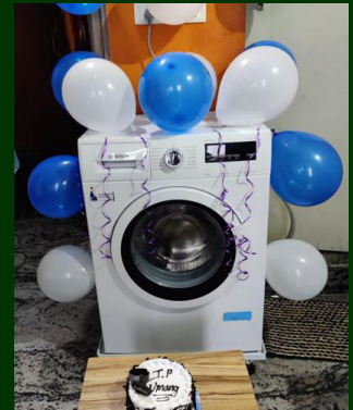
BOSCH WASHING MACHINE