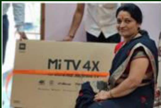
Mi TV 4X